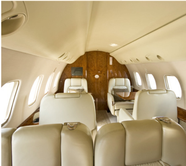
Forward Cabin view