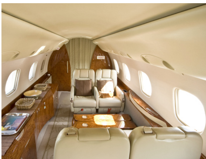
Mid Cabin – rear view

record. The full enrollment on the manufacturers Embraer Enhanced Care and Rolls Royce Corporate Care programs as well as by now the world highest operation standards absolutely secure a maximum safety level and control of your maintenance budget.