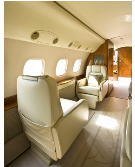
Forward Cabin view