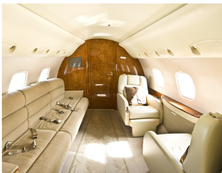
Aft Cabin – rear view