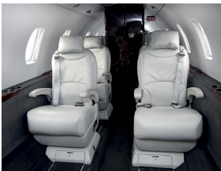
Cabin – rear view

Parts and Power Advantage Plus programs as well as by now the world highest operation standards absolutely secure a maximum safety level and control of your maintenance budget. Even more both engines returned fresh from a scheduled Hot Section Inspection (Oct 2016).