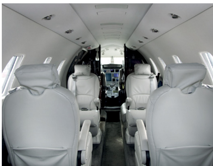
Cabin – front view