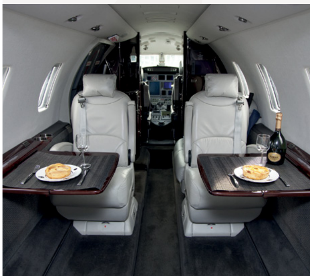
Cabin – front view