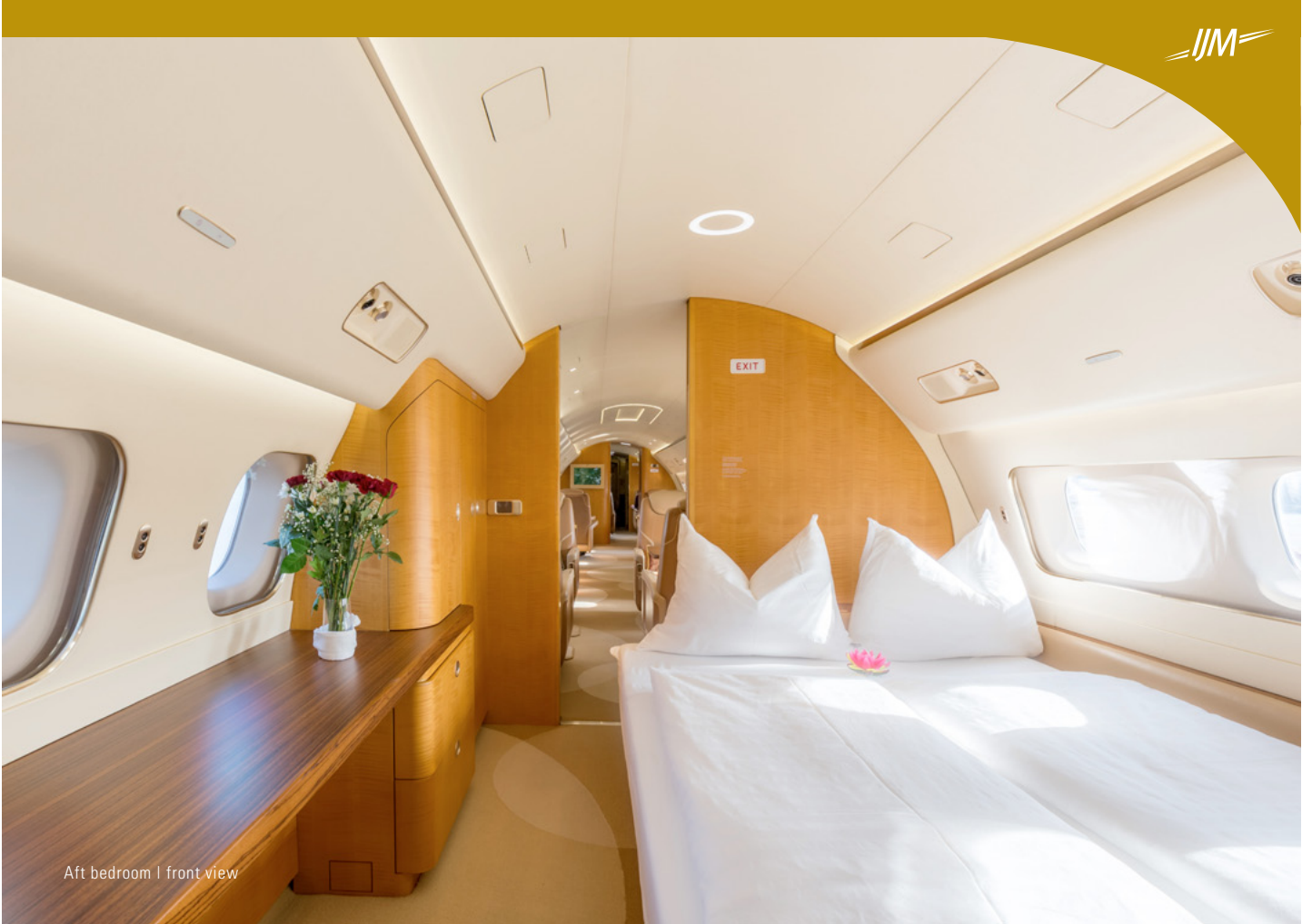
Aft bedroom I front view