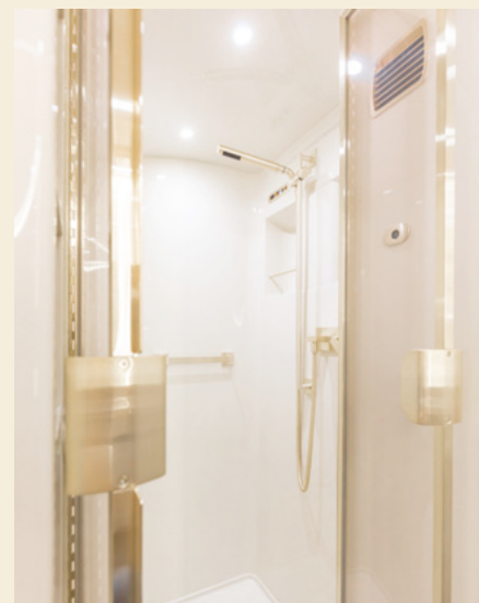
Stand up shower