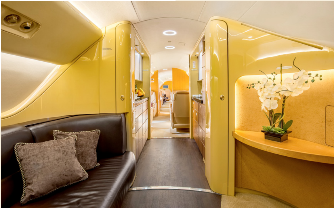
Above left to right: Cabin Zone 4, Cabin Zone 2, Cabin Zone 1 | Below: Entry section