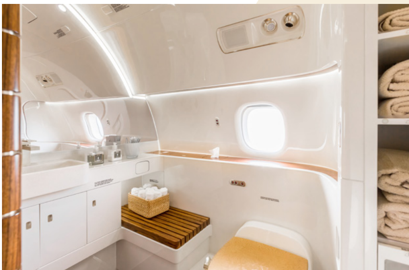
Spacious passenger lavatory

Full berthing reclining capabilities as well as an open and spacious mid-section coming with two single club seats, a wardrobe and passenger lavatory a curved two passenger divan to the right and a credenza including a 32 inch LCD display to the left. A double club seat-opposite to a single club seat configuration leads to the luxurious aft bedroom. The aft baggage compartment is accessible during flight via a swinging door.