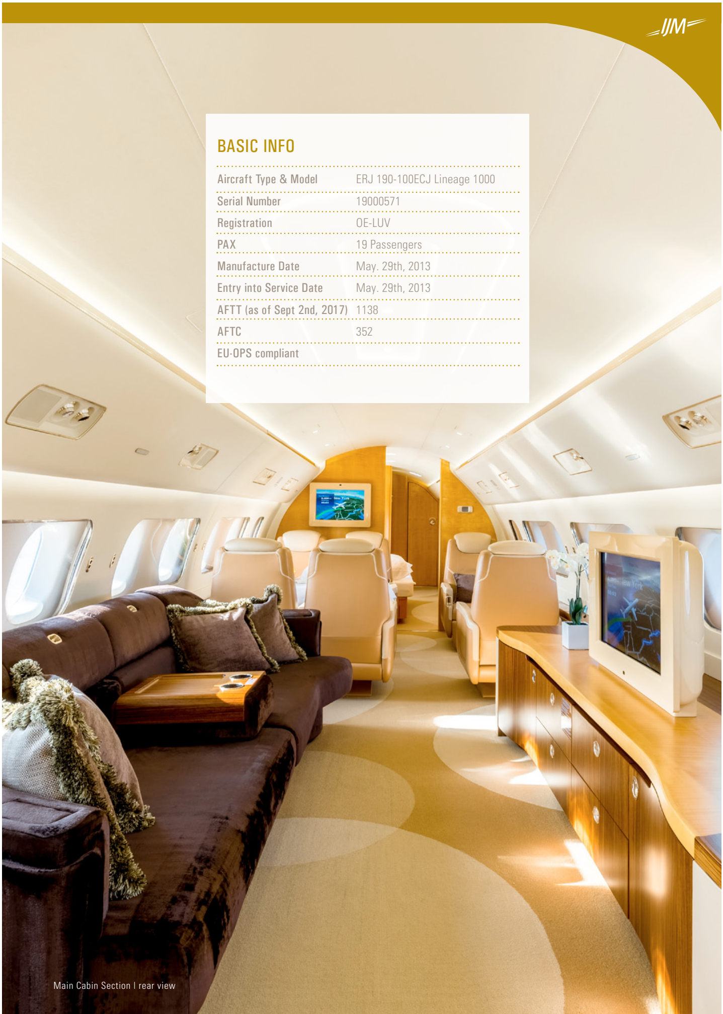
Main Cabin Section I rear view