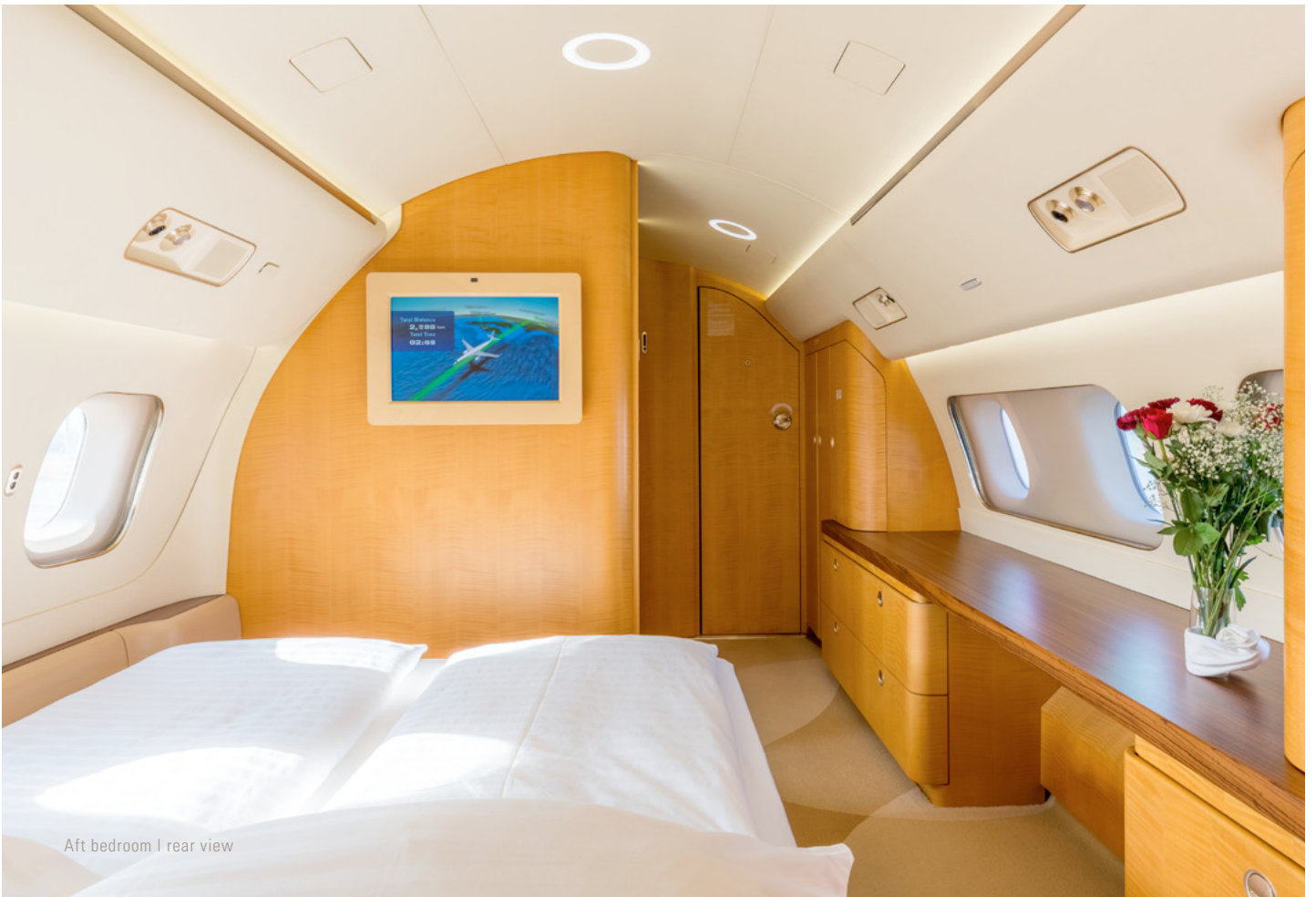
Aft bedroom I rear view